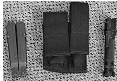
The double BlackHawk pouch holds an SOG multi-tool and SureFire flashlight easily.

The Gladius is unique. The switching has two components: a thumb push-button tail cap and a rotary dial. There are three channels of operation. The first is "momentary," pushing the tailpiece in the correct rotary position only momentarily activates the light. The second is a "strobe" and does just what you think of a strobe light doing. This is used for closing a gap or temporarily blinding a suspect. The third is "constant on" which is adjustable in intensity.