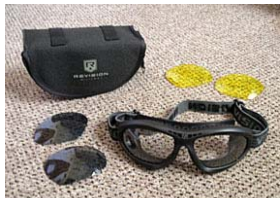
The Revision Eyewear Ltd., Bullet Ant Goggles are better than any others I've found.

Along with the training they issued us some very basic equipment, like leather gloves, a flashlight, a helmet, and a bag to keep it all in. Also included was a pair of "safety glasses." Well, I wasn't real happy with the quality of the glasses so I started looking to see what would really do the job of protecting my eyes either during a disaster or during disaster relief activities or cleanup—and do it well.