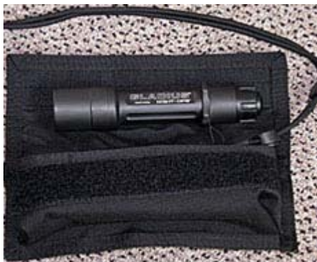
The BlackHawk pouch for the Gladius.

Now BlackHawk is calling this a duty flashlight and pistol mag combo, but the multi-tool fits just right. It is made of a heavy, durable nylon-type material with hook and loop fasteners to hold the equipment securely. The belt loops also have hook and loop fasteners on them and they can be opened and installed on a BlackHawk duty belt for which they were designed. BlackHawk calls this the BTS system. I’m happy just slipping my black leather through the loops. This pouch retails for $24.95 and is really worth it.