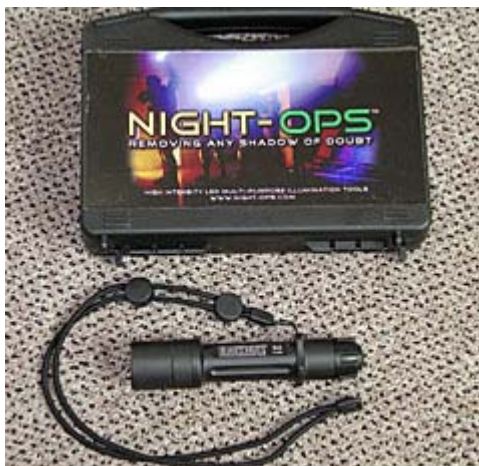
The Gladius flashlight with the Night-Ops box that it comes in. Fancy.

My eyes are important to me; without them I probably wouldn't be doing this right now, so they are worth protecting. The Bullet Ant Goggles that I have come with three different inserts—one clear, one yellow and the third gray-tinted to fill any need. Also available for them is an insert that your optometrist can fill with your personal eyeglass prescription.