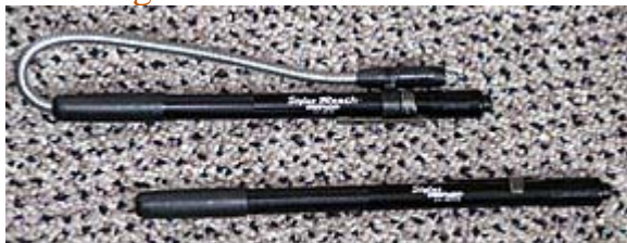
The Streamlight Stylus Lights

While there are many occasions when you need a lot of light, there are those other times when you can have too much light or don't need the amount that something like the Gladius puts out.