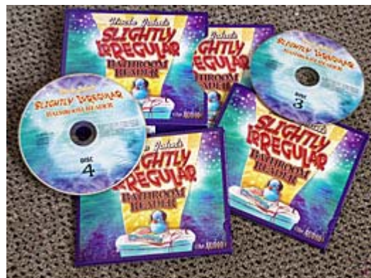
Uncle John's CDs will give you hours of entertainment.

It was unusual how I discovered this next item. In December, it will be two years that my father died. In the process of doing what you have to do after a relative's death, we were going through some of his books. I found two that were Uncle John's Bathroom Readers (The Bathroom Readers Institute, PO Box 1117, Dept. GWK, Ashland, OR 97520; phone: 888-488-4642; on-line: www.bathroomreader.com ). These books are full of totally useless information. Well, let's not call it useless. When opening to any page you can find humor, trivia, science and history, some mythology, pop culture and much, much more.