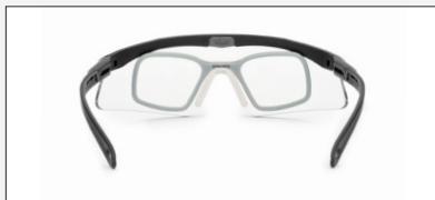
OPTIONAL RX CARRIER