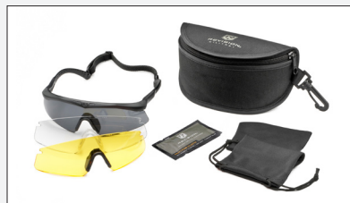
SAWFLY DELUXE KIT