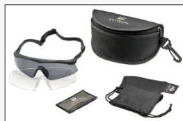
U.S. MILITARY KIT

AVAILABLE IN BLACK, TAN AND FOLIAGE GREEN