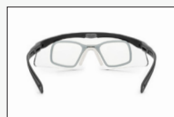
OPTIONAL RX CARRIER