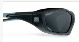
BLACK FRAME POLARIZED LENSES 4-0491-0024