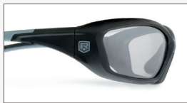
BLACK FRAME CLEAR LENSES 4-0491-0001