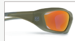
KHAKI FRAME FLAME MIRROR LENSES 4-0491-0009