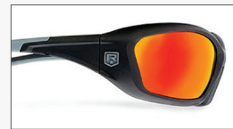
BLACK FRAME FLAME MIRROR LENSES 4-0491-0022