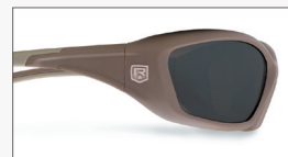
TAUPE FRAME SMOKE LENSES 4-0491-0005