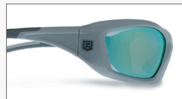
SILVER FRAME OCEAN MIRROR LENSES 4-0491-0007