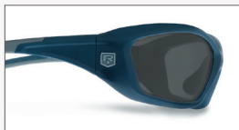
STEEL BLUE FRAME SMOKE LENSES 4-0491-0006