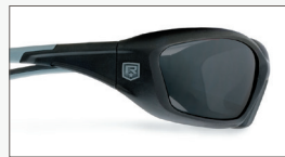
BLACK FRAME SMOKE LENSES 4-0491-0002