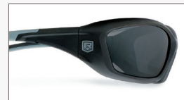
BLACK FRAME PHOTOCHROMIC LENSES 4-0491-0016