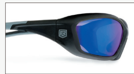
BLACK FRAME MIDNIGHT MIRROR LENSES 4-0491-0003