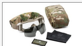
U.S. MILITARY KIT - TAN499 MULTICAM