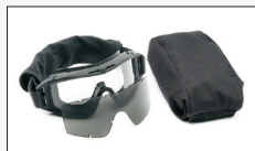
U.S. MILITARY KIT