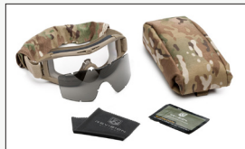
U.S. MILITARY TAN 499 KIT