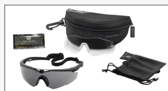
STINGERHAWK U.S. MILITARY KIT