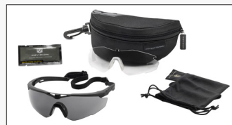
STINGERHAWK U.S. MILITARY KIT