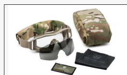
U.S. MILITARY KIT - TAN499 MULTICAM