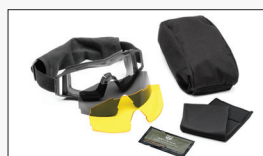
DELUXE KIT - BLACK

*The high-contrast specialty lenses are not approved for military use by the U.S. Army.